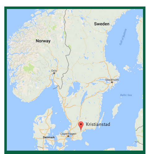
Kristianstad, Sweden, is located in Skåne County in southern Sweden.