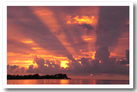
Sunset in Jamaica

For more information on MSU's engaging study abroad opportunities visit: www.MinotStateU.edu/International and visit the Office of International Programs.