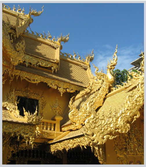
1st Place 2015 Faculty, Staff, Retirees & Alumni Category

Location: Real Alcazar de Sevilla, Spain