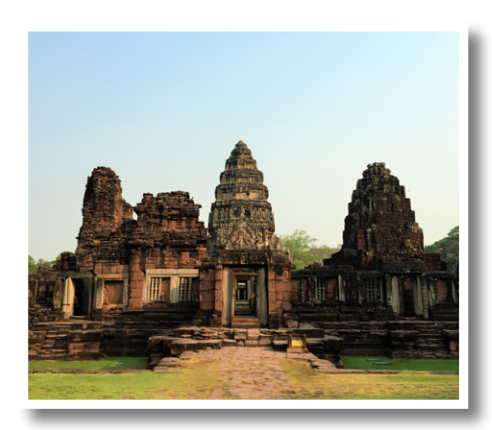
Khmer ruins in Phimai, Thailand

The application deadline for 2017 Summer & Fall programs is February 15th.