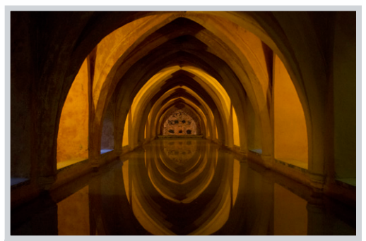
1st Place 2015 Student Category Los Baños de Doña Maria de Padilla, MSU Student majoring in Social Work Taken: May 2015

Support MSU Study Abroad by purchasing a Global Sights Photo Contest Calendar. All proceeds will go to funding a study abroad scholarship! For more info contact: StudyAbroad@MinotStateU.edu