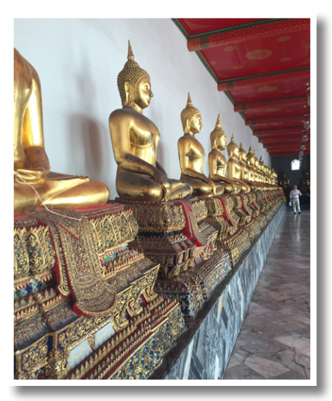
Row of Earth Touching Buddhas at Wat Pho Bangkok, Thailand