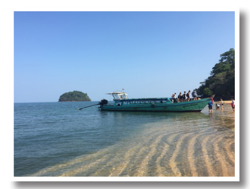
Ko Chang, Ranong, Thailand